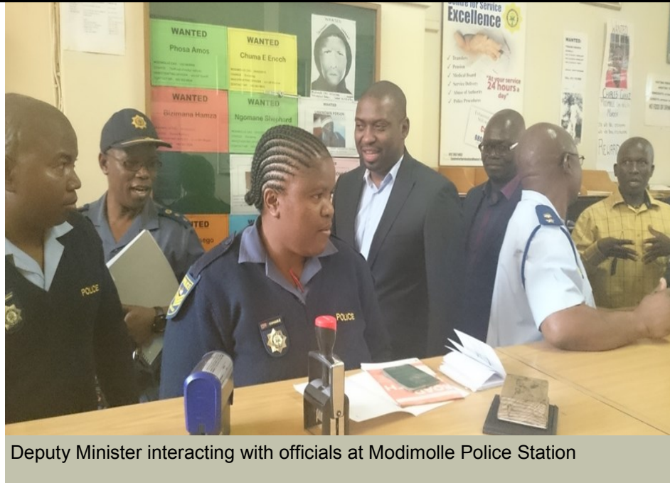
Deputy Minister interacting with officials at Modimolle Police Station