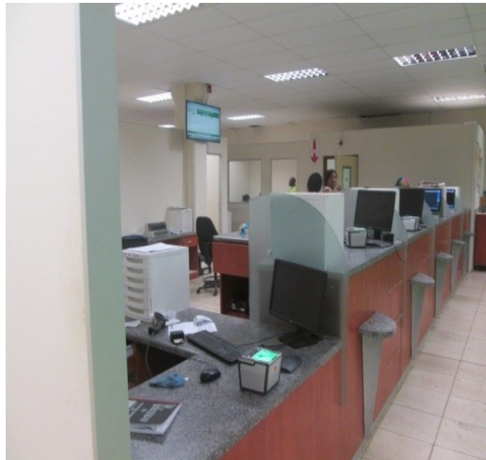
Special lower counter for disability access: Umzimkhulu Home Affairs

from a low base, none of the facility types are yet at the desired rating of 3 and above. Inadequate investment in managing improvements initiatives at facility level is the major challenge. An experienced Lean Management practitioner said “Government has projects to improve staff attitudes, but they should rather invest in fixing processes - good processes will result in good staff attitudes and happy clients” . Continuous operations improvement culture is a requirement for sustaining operations excellence in government departments and facility level for an im-